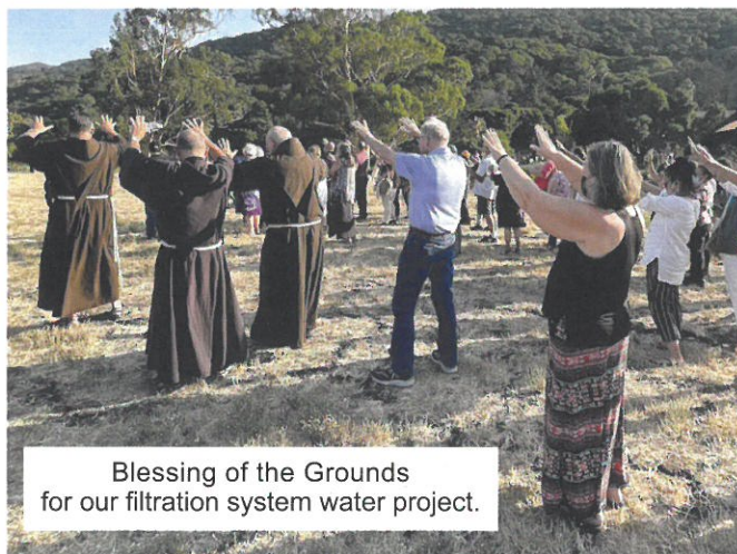
Blessing of the Grounds for our filtration system water project.

If you wish to contribute to this project, you may do so at our website, https://stfrancisretreat.com . Please mention in the comments that you want to earmark your donation to the Sister Water Project.